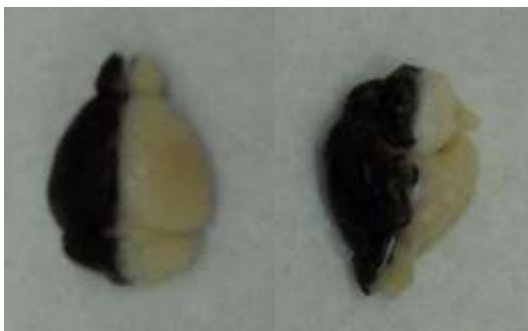
Figure 1. Brain is stained with black marker on the left hemisphere to help distinguish left/right during mounting of free floating sections. Views from the dorsal (left panel, anterior side up) and ventral (right panel, anterior side down) surfaces are shown above.

Mice were anesthetized with 5% isoflurane and intracardially perfused with 10 ml of saline (0.9% NaCl) followed by 50 ml of freshly prepared 4% paraformaldehyde (PFA) at a flow rate of 9 ml/min. Brains were rapidly dissected and post-fixed in 4% PFA at room temperature for 3-6 hours and overnight at 4°C. The next day, brains were rinsed briefly with PBS. After removing residual moisture on the surface with a Kimwipe, a permanent marker (BIC Mark-It) was applied on the left hemisphere to stain both dorsal and ventral surfaces as shown in Figure 1. Then, the brains were transferred to 30% sucrose solution, and left for approximately 2 days until they sink to the bottom of the tube. Cryoprotection in sucrose has been shown to protect brains from ice crystal formation during the following cryosectioning step. In addition to the marker, the brains were skewered using a 22 gauge needle through the mid-sagittal plane of the left hemisphere. Either the residual ink on the brain surface or the punched hole on the left side of the brain was used to distinguish left vs. right hemispheres during mounting of free floating sections. Brains were embedded and frozen in OCT mounting medium in a grid-lined freezing chamber for standardized placement of brain as previously described ( Data Production Processes in the Documentation section of the Allen Mouse Brain Atlas). Brains were stored at -80°C prior to sectioning.