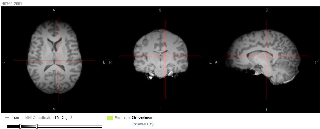
Figure: T1 MR scan for donor 'H0351.2002'

See example code on how to transform each microarray sample to MNI space.