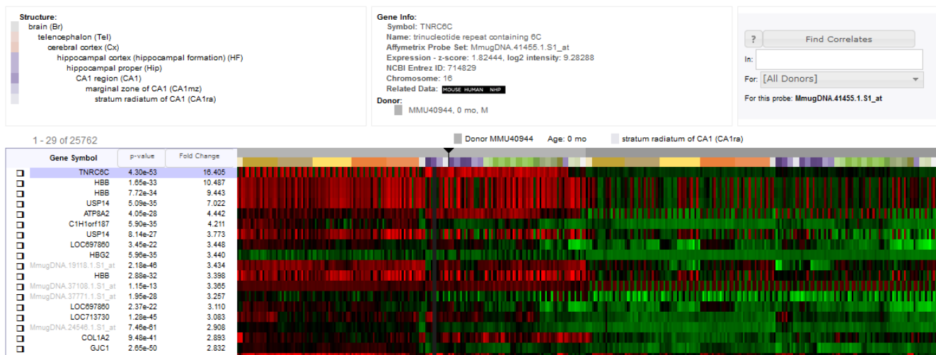
Figure: Screenshot of top returns of a differential search for genes with higher expression at 0 months than 3 months represented as a z-score heatmap ranging from green (below mean) to red (above mean).