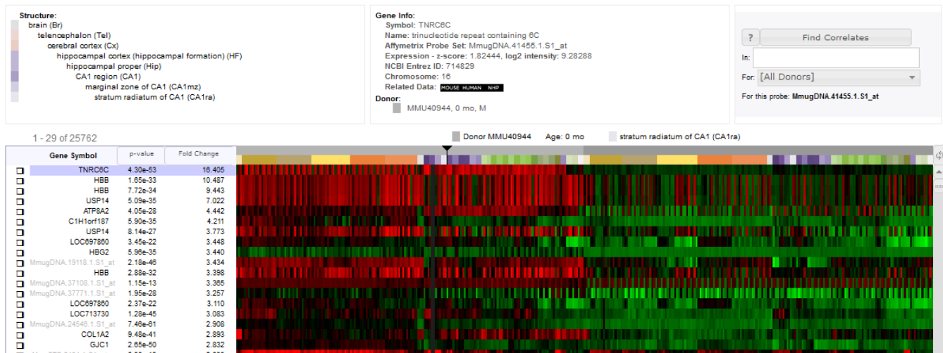
Figure: Screenshot of top returns of a differential search for genes with higher expression at 0 months than 3 months represented as a z-score heatmap ranging from green (below mean) to red (above mean).