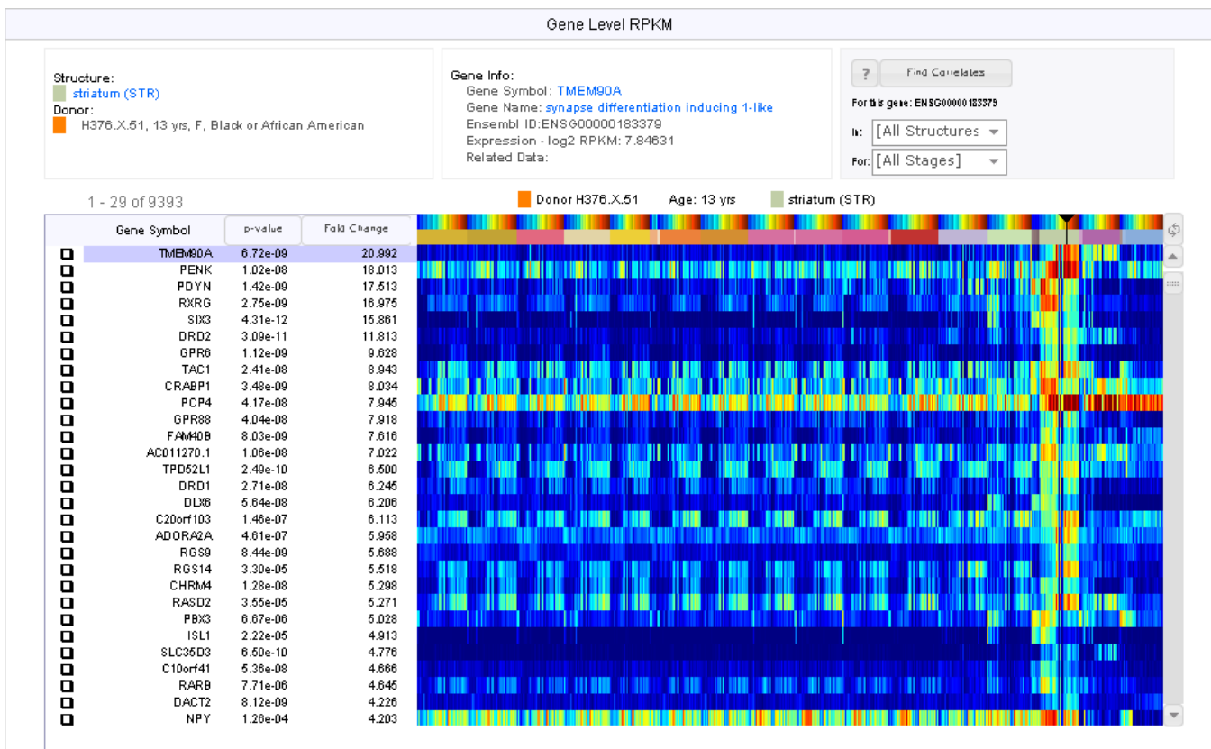
Figure: Screenshot of top returns of a differential search for genes with higher expression in the striatum than in the whole neural plate.