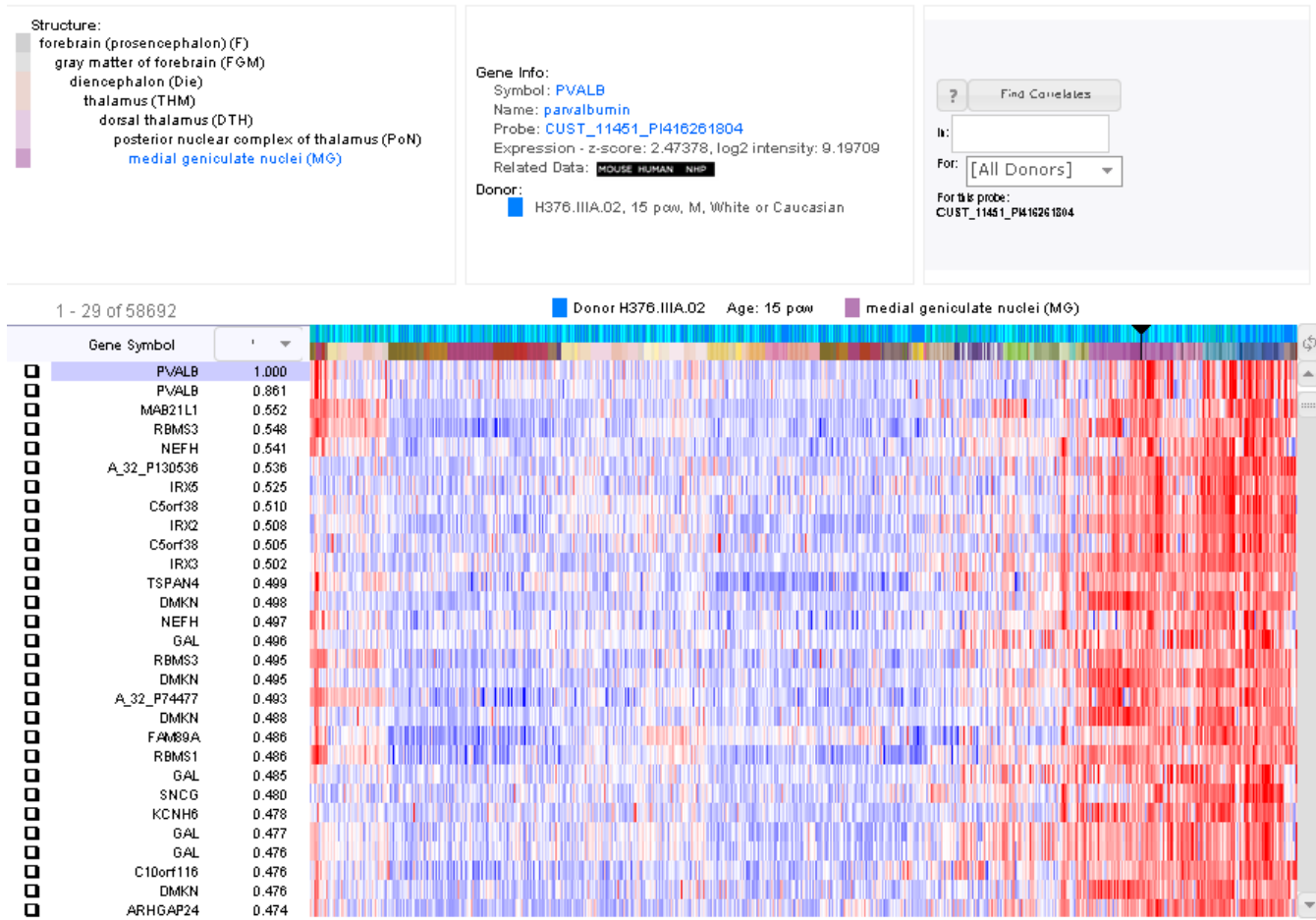
Figure: Screenshot of top returns of a correlative search for probes with similar expression to a PVALB probe with expression values displayed as a z-score heatmap.