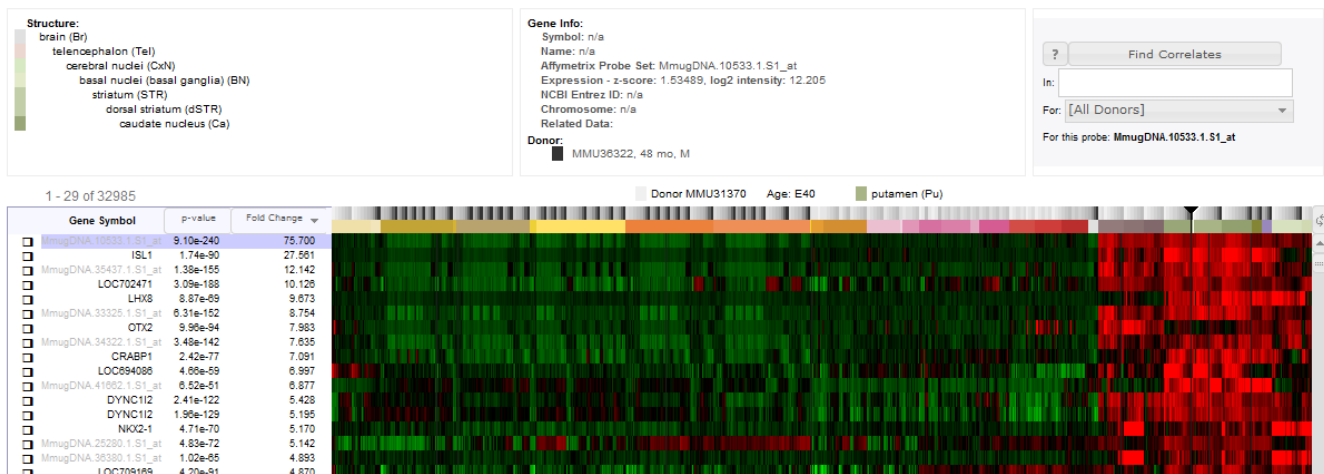
Figure: Screenshot of top returns of a differential search for genes with higher expression in the basal ganglia than in the neocortex represented as a z-score heatmap ranging from green (below mean) to red (above mean).