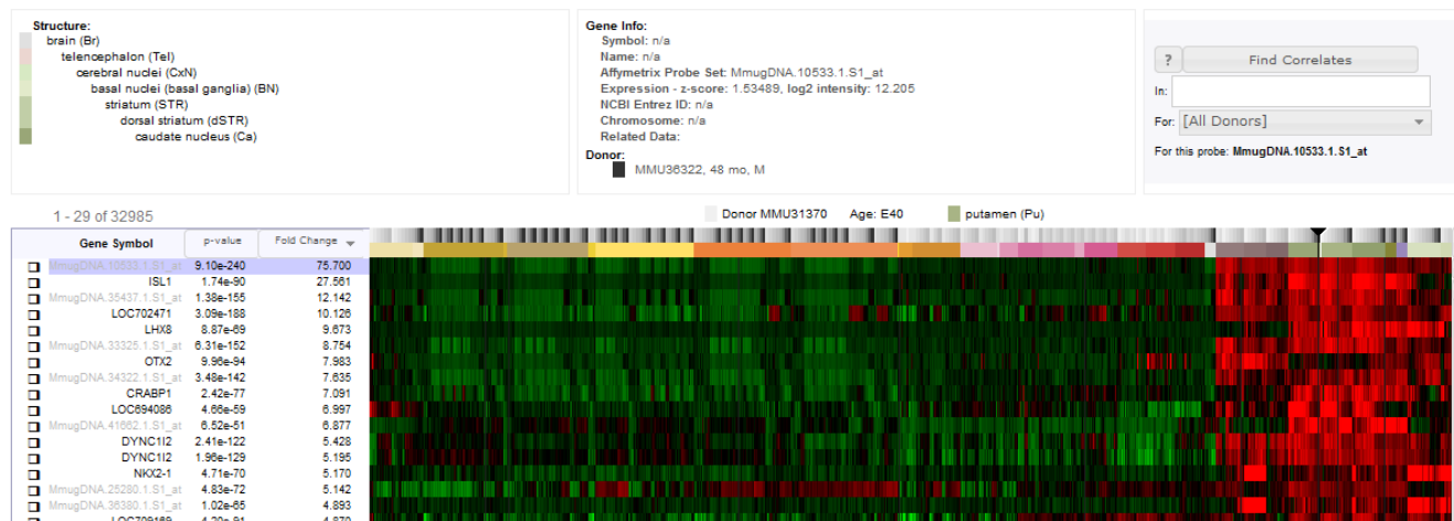
Figure: Screenshot of top returns of a differential search for genes with higher expression in the basal ganglia than in the neocortex represented as a z-score heatmap ranging from green (below mean) to red (above mean).